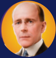
Rtn. Paul Harris FOUNDER OF ROTARY